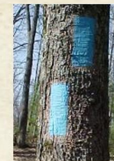
Blaze for right turn.