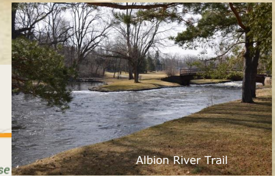
Albion River Trail