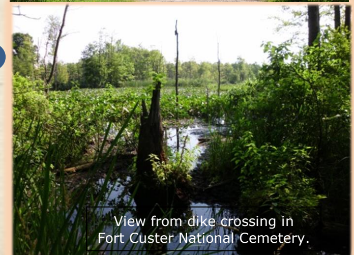
View from dike crossing in Fort Custer National Cemetery.