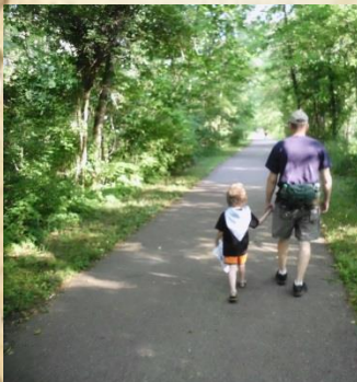
Paul Henry Thornapple Trail

Chief Noonday Chapter portion of North Country National Scenic Trail