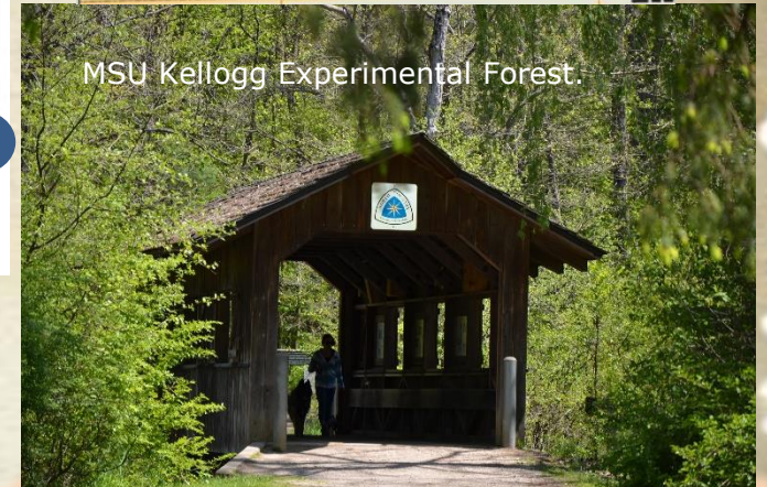
MSU Kellogg Experimental Forest.

Legend — Existing NCT --- Temporary Connector --- Other Trail 0 4 8 Miles