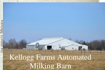
Kellogg Farms Automated Milking Barn