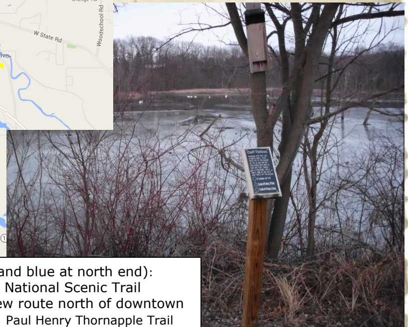
Middleville mill pond

Green Line (and blue at north end): North Country National Scenic Trail Red Line : New route north of downtown Yellow Line : Paul Henry Thornapple Trail Blue Line (SE of Middleville): November alternative (PHTT section closed)