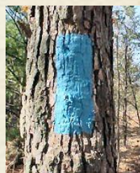
Blaze for straight ahead.