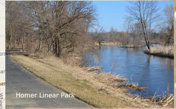
Homer Linear Park