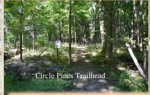
Circle Pines Trailhead