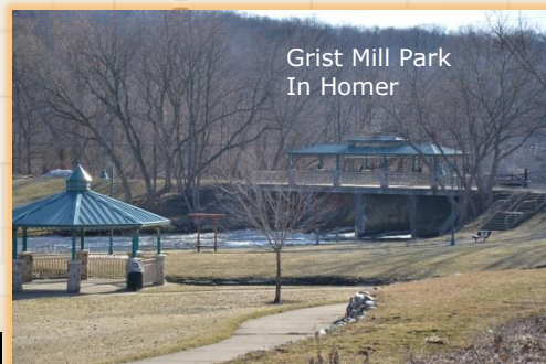
Grist Mill Park In Homer