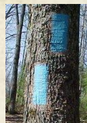
Blaze for right turn.