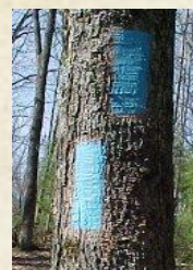
Blaze for right turn.