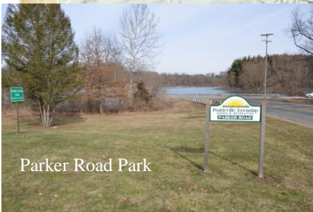
Parker Road Park