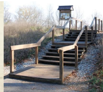
Kiosk at W.K. Kellogg Bird Sanctuary