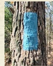
Blaze for straight

Sign up for our quarterly newsletter for our upcoming events, and to see what we've been doing, by signing up with our secure provider at: http://eepurl.com/bBn5aP