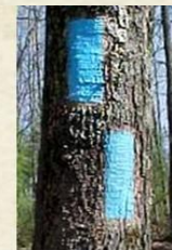
Blaze for left turn.