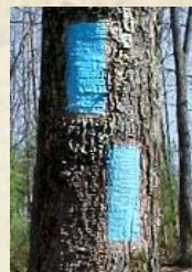
Blaze for left turn.