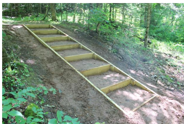
Finished steps with earthen fill near Esox Lake.