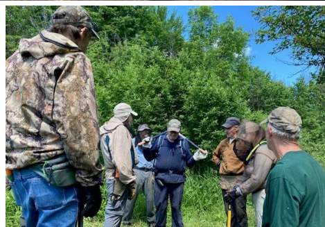
Photos clockwise, top to bottom: 1.) Chequamegon Chapter Volunteers assemble at the beginning