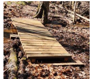
Photos left to right: 1. Ed leading hike on the North Country Trail 2. April 2024: Ed's first built punchons on his