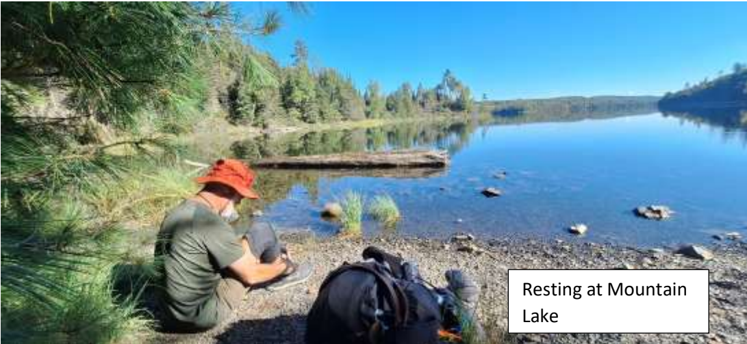
Resting at Mountain Lake

Monday 9/9 on the trail at 730am again. Trail east of clearwater lake was a major blowdown section, but we took