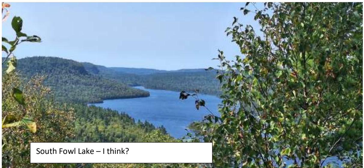
South Fowl Lake – I think?

We started out Saturday September 7 th and hiked west bound from the 270° overlook. The first 13 miles are not in the wilderness area so we stayed our first night at McFarland Lake CG 12.5 miles today.