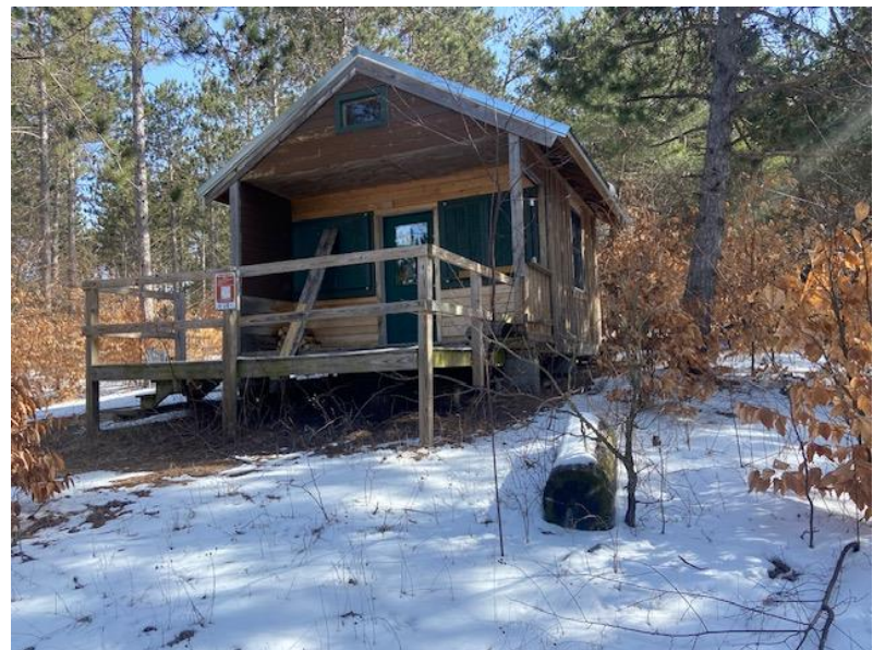
Winter View of the Shelter