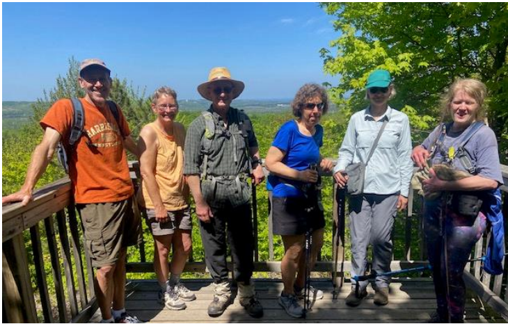
Spring View from Platform