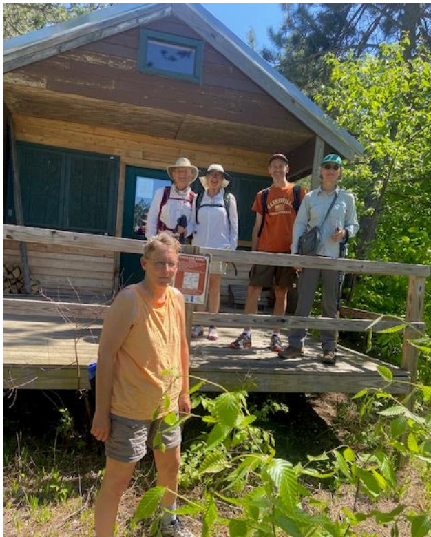
Spring View of Shelter