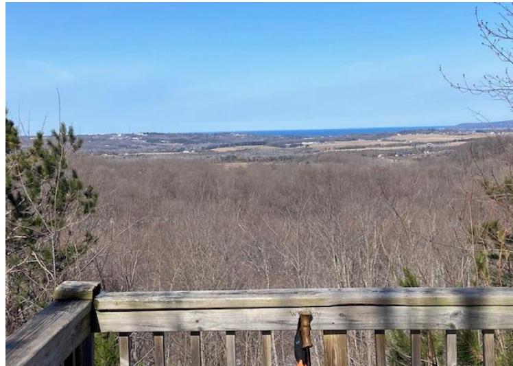
Winter View from Platform