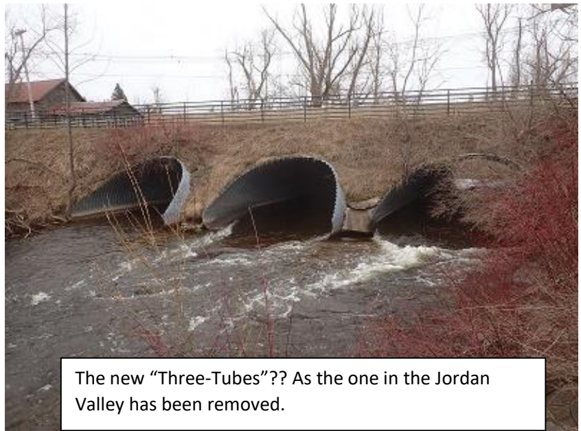
The new "Three-Tubes"?? As the one in the Jordan Valley has been removed.