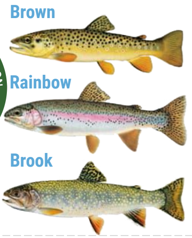
Illustrations by Joseph R. Tomelleri ©

To the North 13m From here, the trail is a road walk to the city of Lowell ; most of the route is farmland. After twelve miles, it crosses the Grand River into Lowell, the National Headquarters of the NCTA . The office is on the northwest corner of Main St. (M21) and N. Monroe.