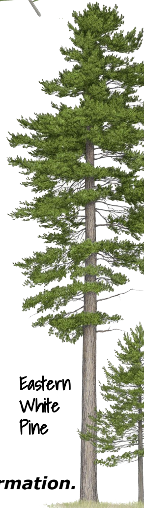
Eastern White Pine